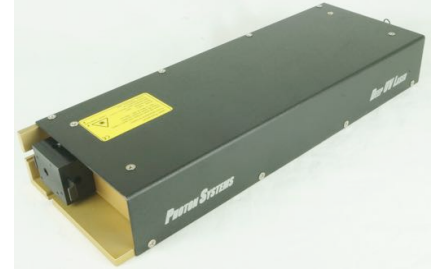
Series 30 Laser with integrated controller