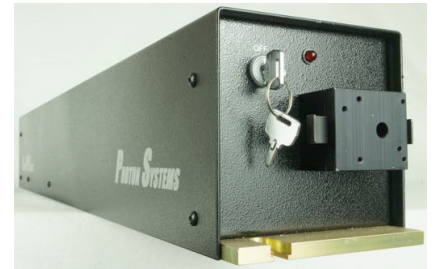
Series 70 Laser with integrated controller