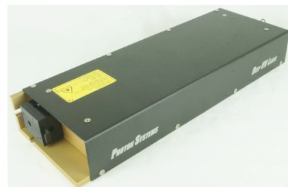
Series 30 Laser with integrated controller