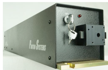
Series 70 Laser with integrated controller