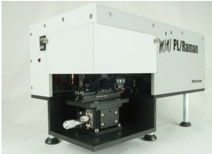
Mini PL 110 with optional X-Y motorized stage