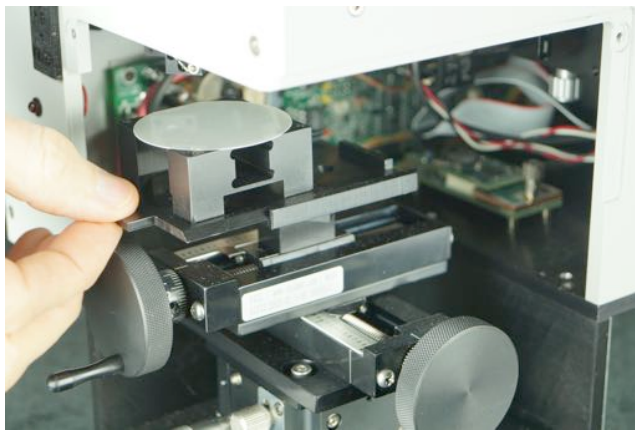
Loading a wafer onto the manual stage