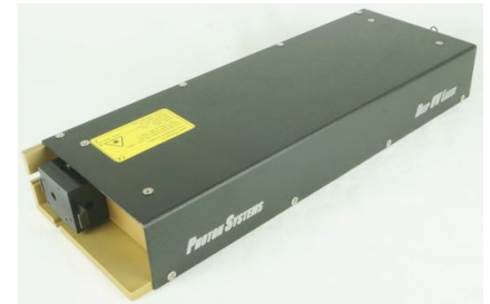
Series 30 Laser with integrated controller