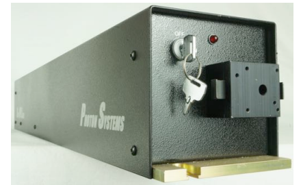
Series 70 Laser with integrated controller